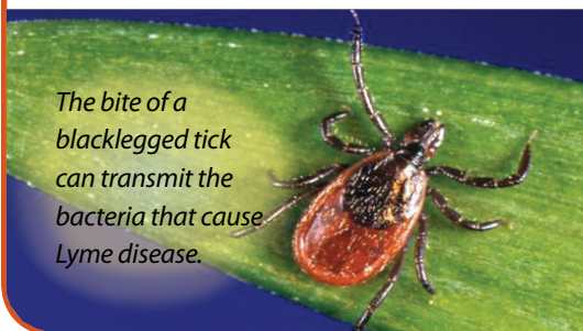
The bite of a blacklegged tick can transmit the bacteria that cause Lyme disease.