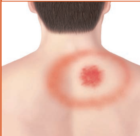
Bull's eye rash on the back.